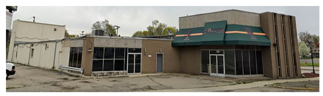
The first BeneSys office was a former drapery cleaning building (left), with 25-foot ceilings in the back.