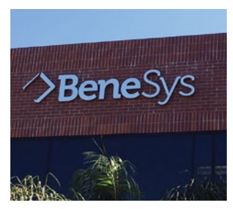
After expanding west in 2004, we moved into our current West Coast headquarters in Pleasanton, California (above), in 2011.

to come in every few hours to check on progress.